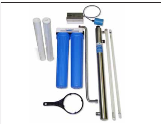
The system ships complete with all necessary components and installation hardware