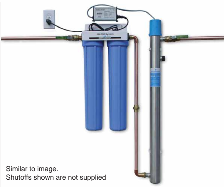
Similar to image. Shutoffs shown are not supplied

This residential water purification system offers very efficient water treatment at a low cost per unit volume. The system is designed for ease of installation and is fully tested prior to shipment.