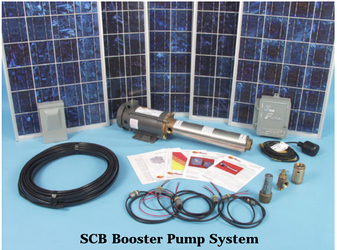
SCB Booster Pump System